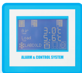
Hygienic touch screen controller

Fitted with a Dual Compressor to ensure greater temperature control and peace of mind in the event of failure of one of the systems. Each complete refrigeration system provides 100% performance, sufficient to cool down and maintain temperatures correctly without help from the second compressor.